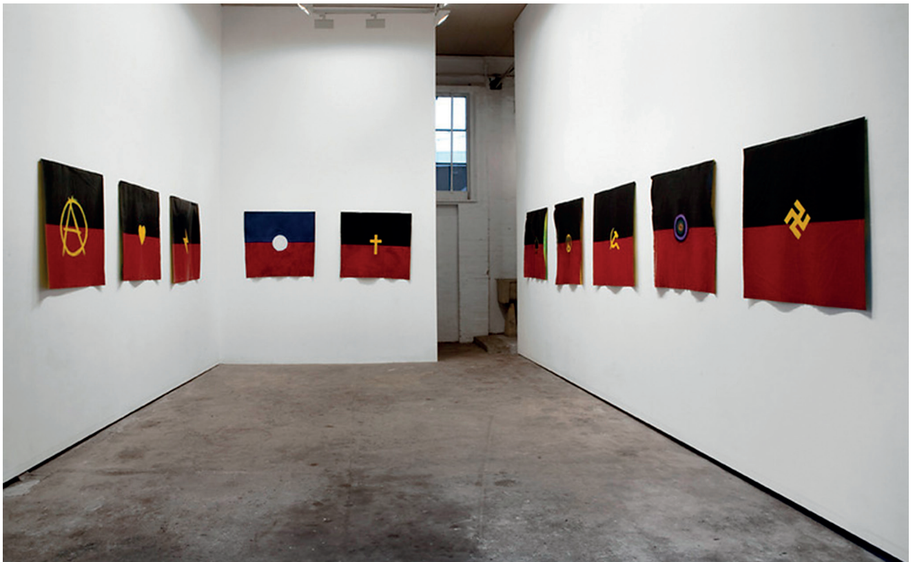
Installation view: Archie Moore, Flag The Commercial, Sydney